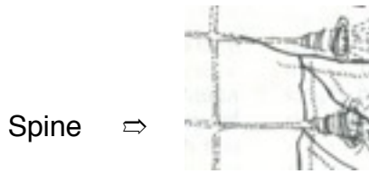
Heart & Solar Plexus chakras

The general appearance of the chakra can be visualised as a twining plant with trumpet-shaped flowers.